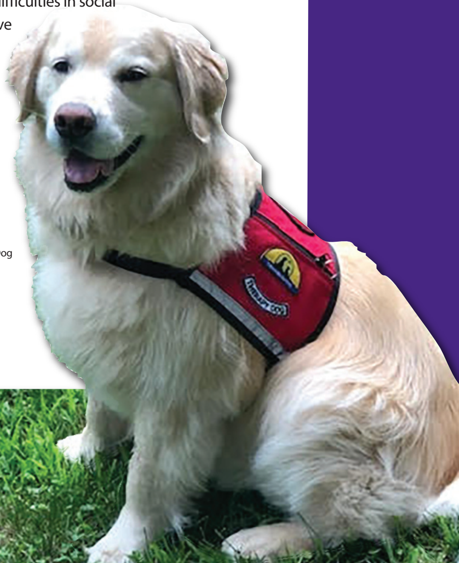
Ryder the Shelter Dog

This was particularly helpful for kids who were returning to school after extended virtual participation and experiencing difficulties in social interactions and connection to others. Parents have reported that building a relationship with Ryder has made a huge difference in their children's lives and they have noticed their behaviors starting to improve. When the children leave the shelter, they receive a framed picture of Ryder as a transition object to carry forward a positive memory of their time there. ♦